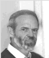
Department Head/Research Manager